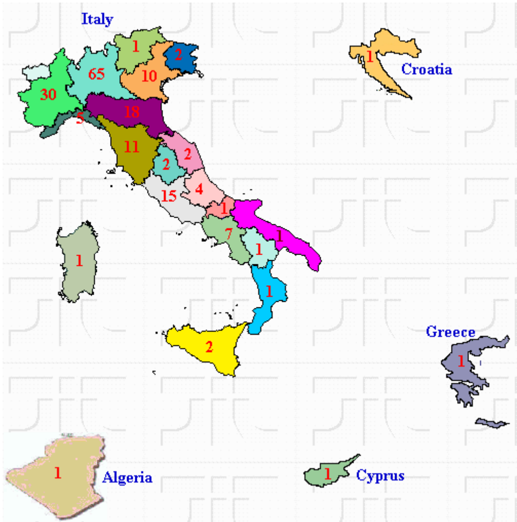
Fig. 1 - Geographical distribution of SIT Centres (at the end of the year 2007).

Figure 1 shows the geographical distribution of the SIT Centres at the end of the year 2007.